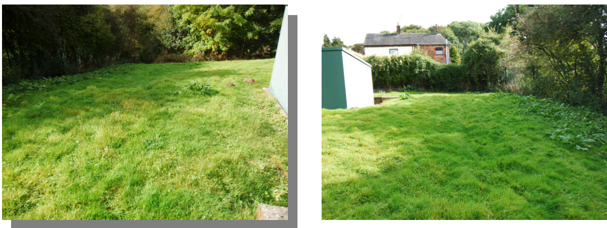
Figure 1 – Location of proposed kiosk

The proposed development is located within the existing operational boundary of Teanford borehole pumping station upon an area of grassland, as shown in Figure 1 below.