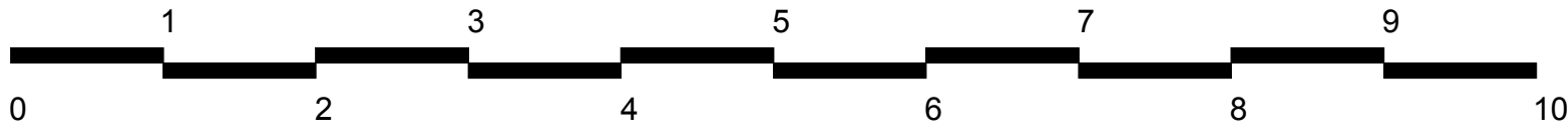
Scale - meters