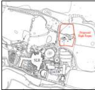
Location Plan and Layout