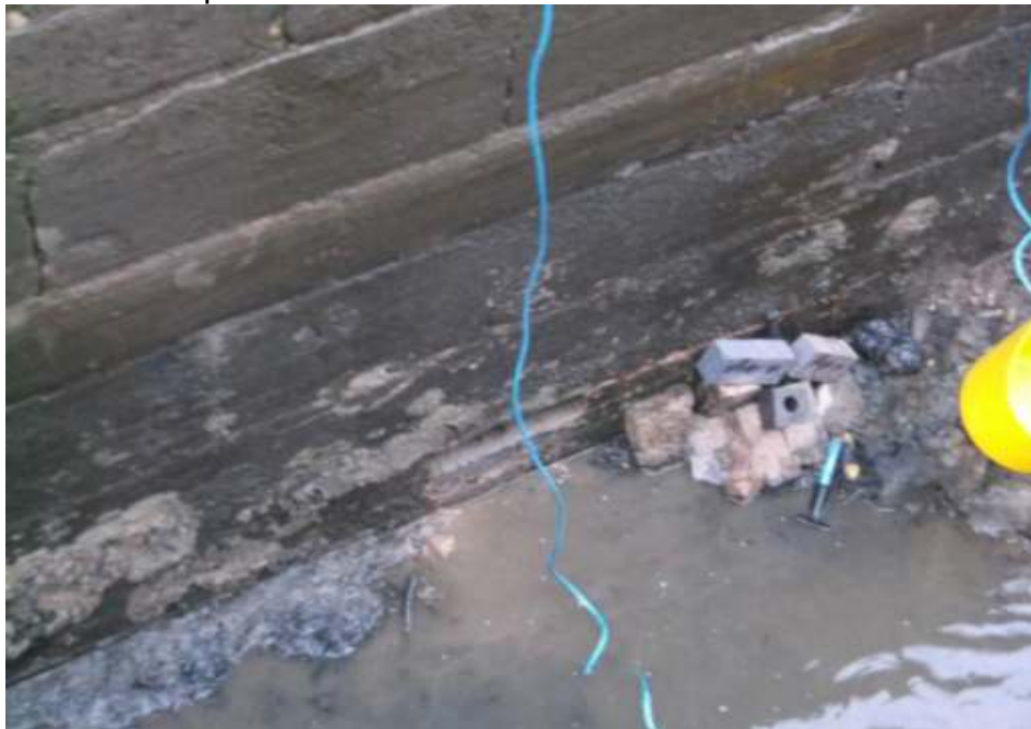
Outlet 2 Towpath side after some brickwork removed.