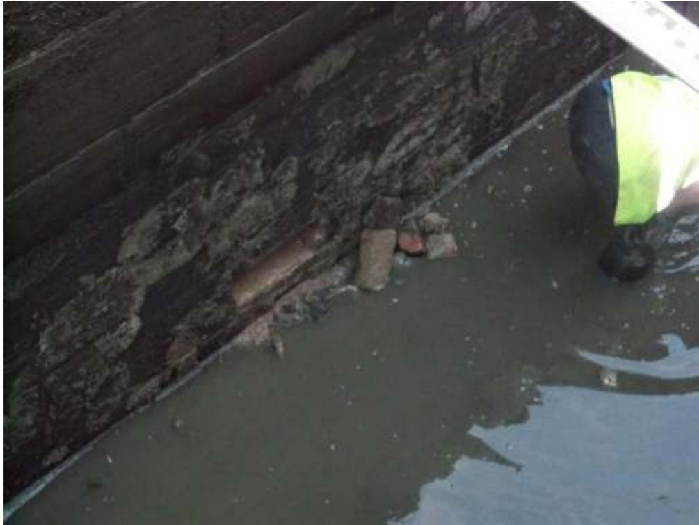
Outlet 3 Towpath side after bricks removed.

Several of the air vent cover plates were removed during the survey but access was not suitable for CCTV inspection. CRT carried out a visual inspection down the air vent shaft with a torch.