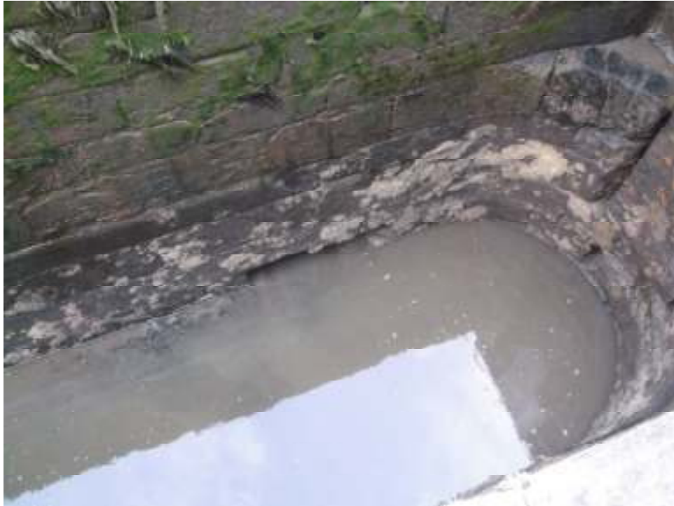
Outlet 4 offside.