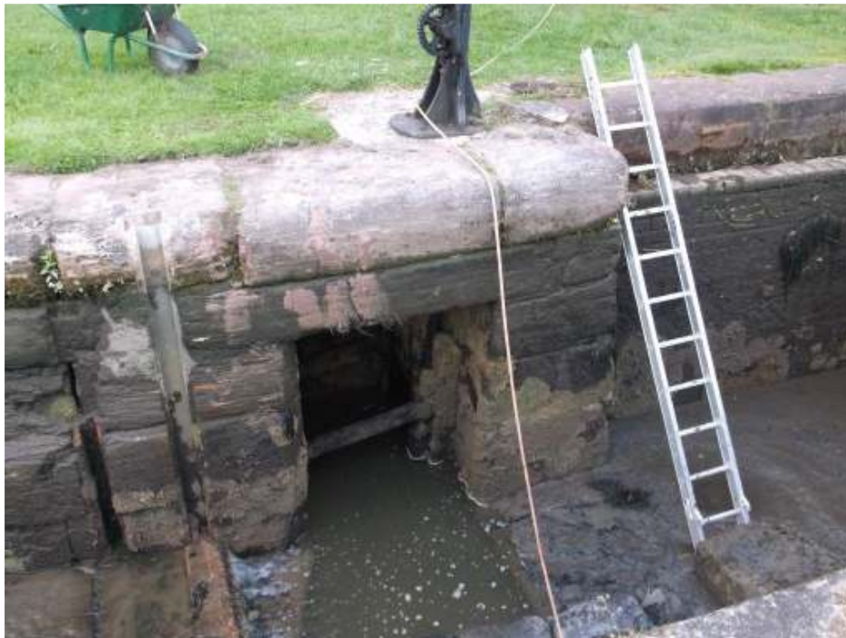
Photo of dewatered Paddle Chamber 1.

The section between Vent 2 and Outlet 3 was found to have been back filled with clay, no survey was possible of this section of culvert.