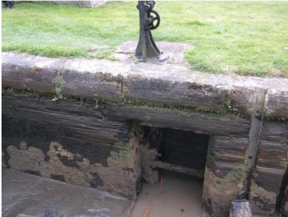
Paddle Chamber 2 after dewatering.

The 600mm x 600mm Masonary culvert was surveyed downstream a total of 22.9m to Outlet 6.