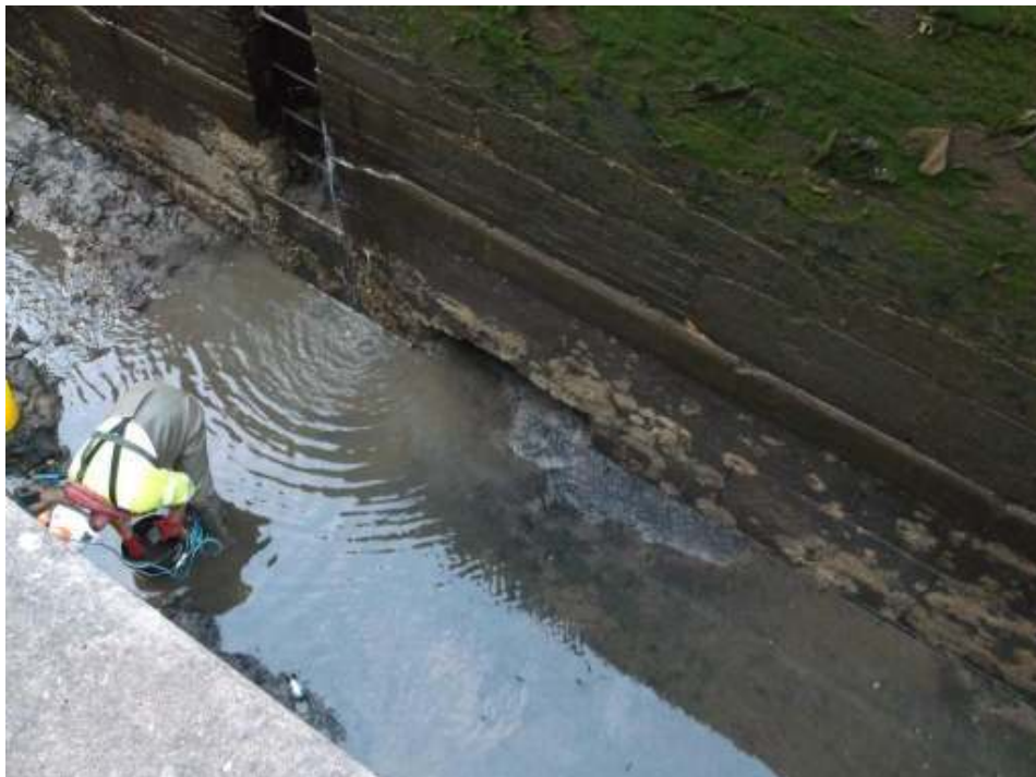
Outlet 5 offside.