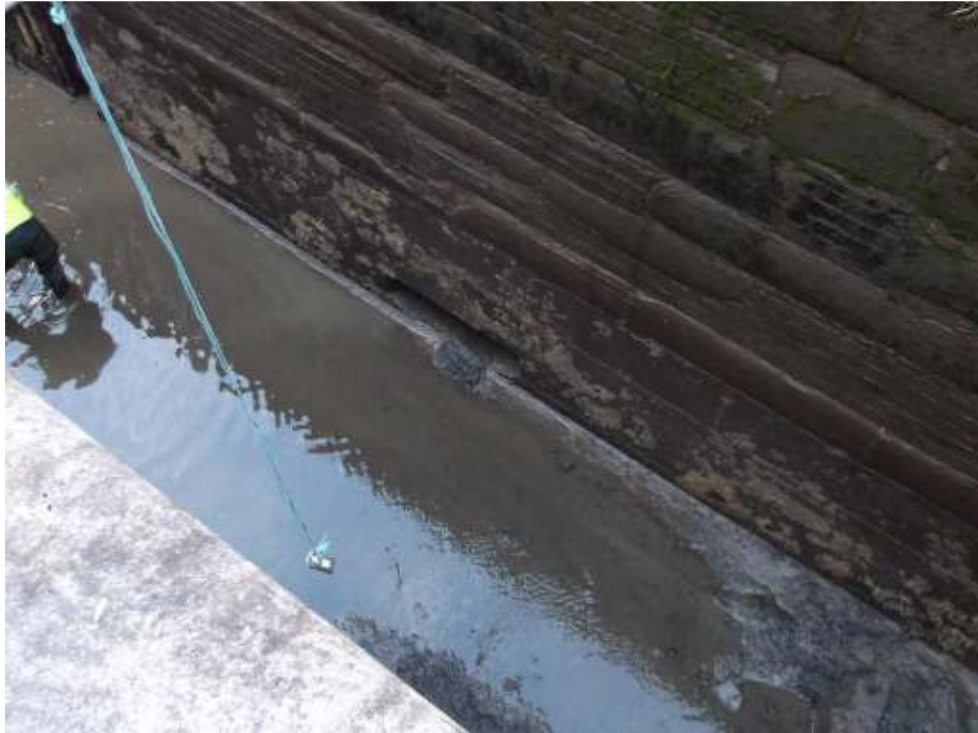
Outlet 6 offside.