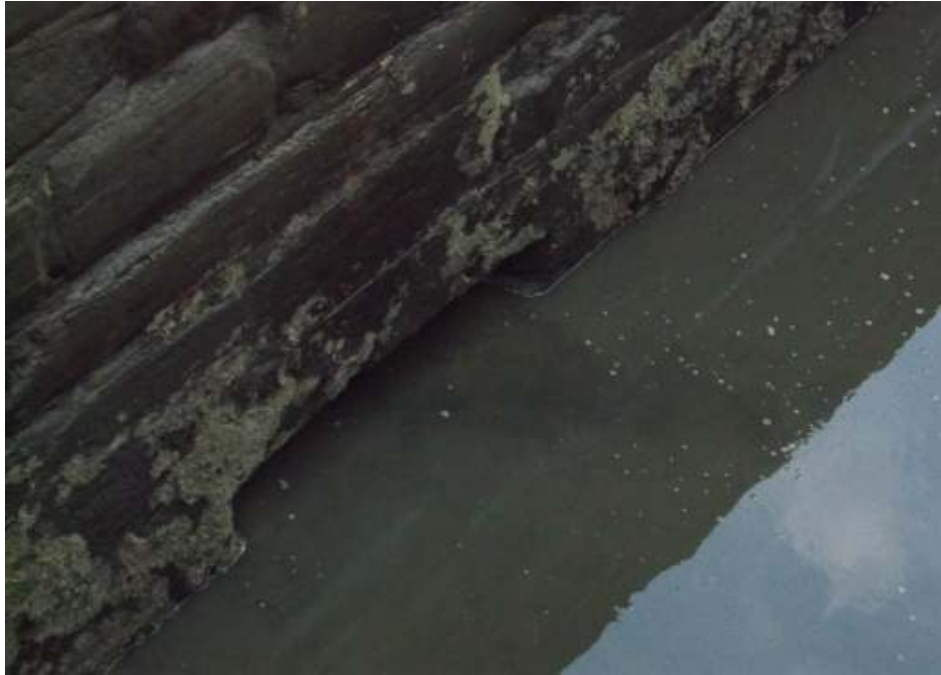
Outlet 1 Towpath side.