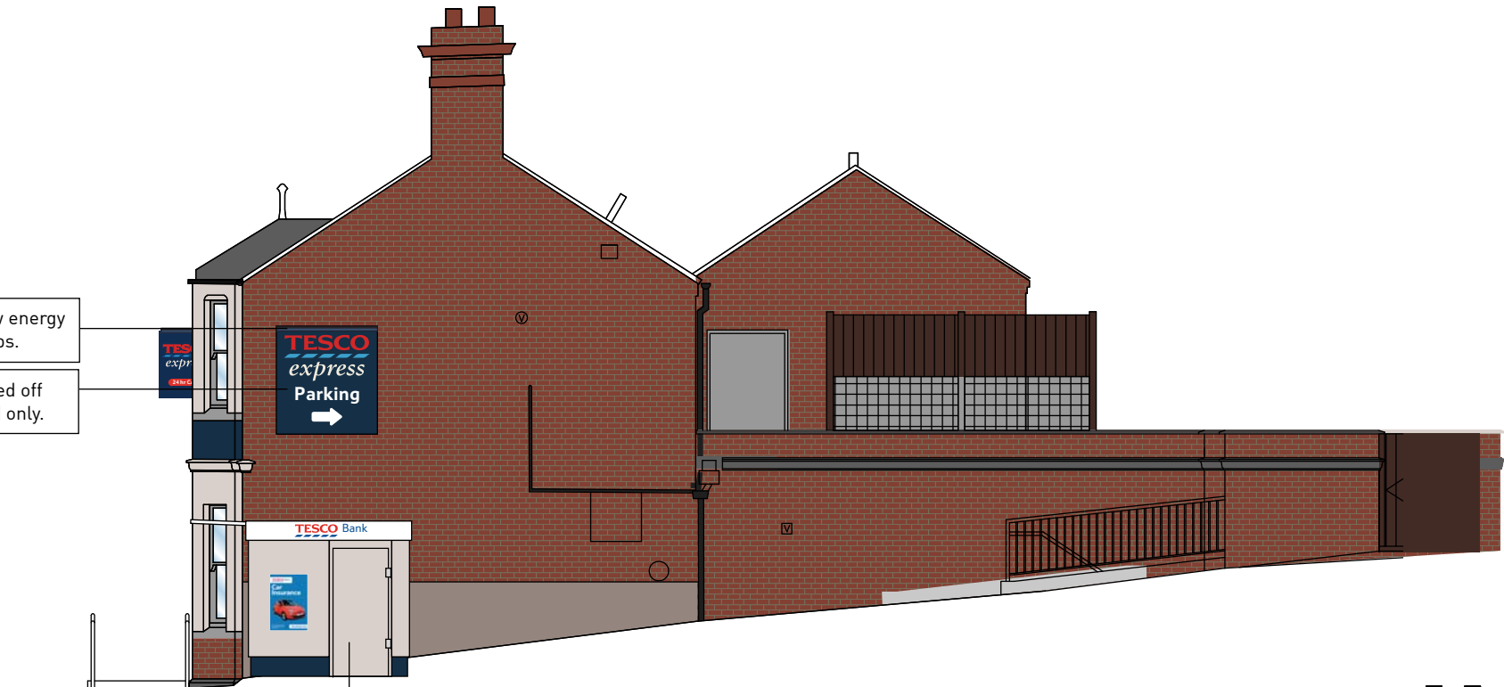
SIDE ELEVATION (CAR PARK)

Slim line trough light using low energy level compact flourescent lamps. Fascia with 10mm acrylic pinned off lettering externally illuminated only.