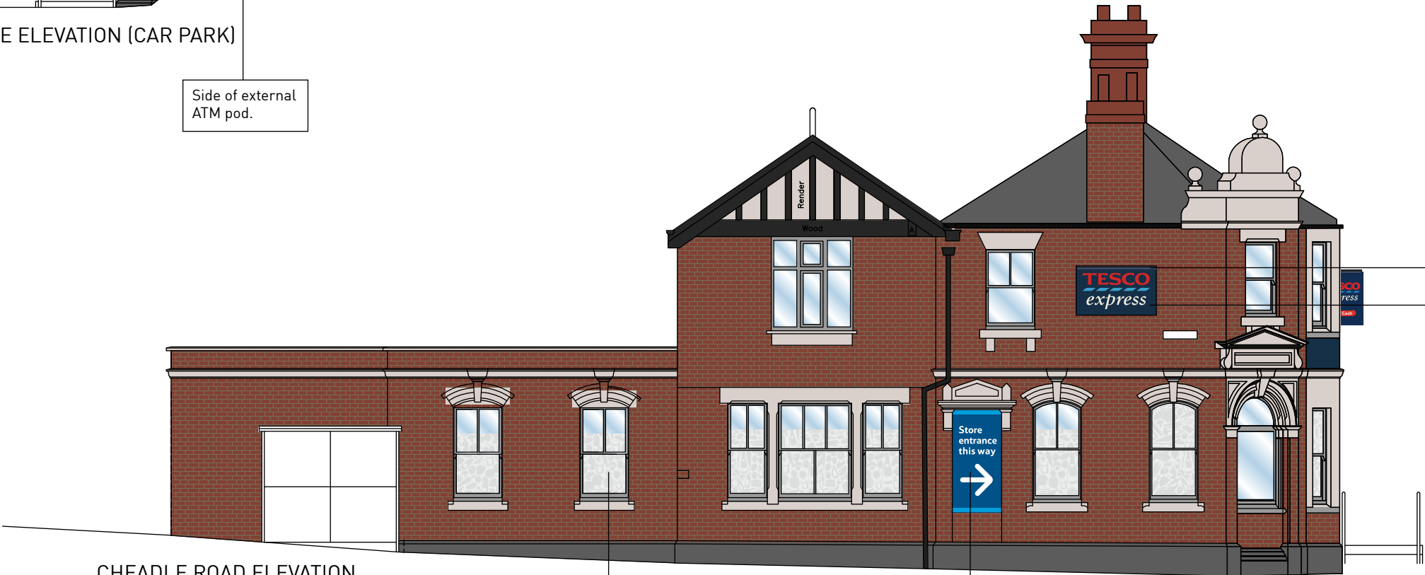
CHEADLE ROAD ELEVATION

Icon frosted vinyl up to 2100mm from internal floor level to hide back of mods.