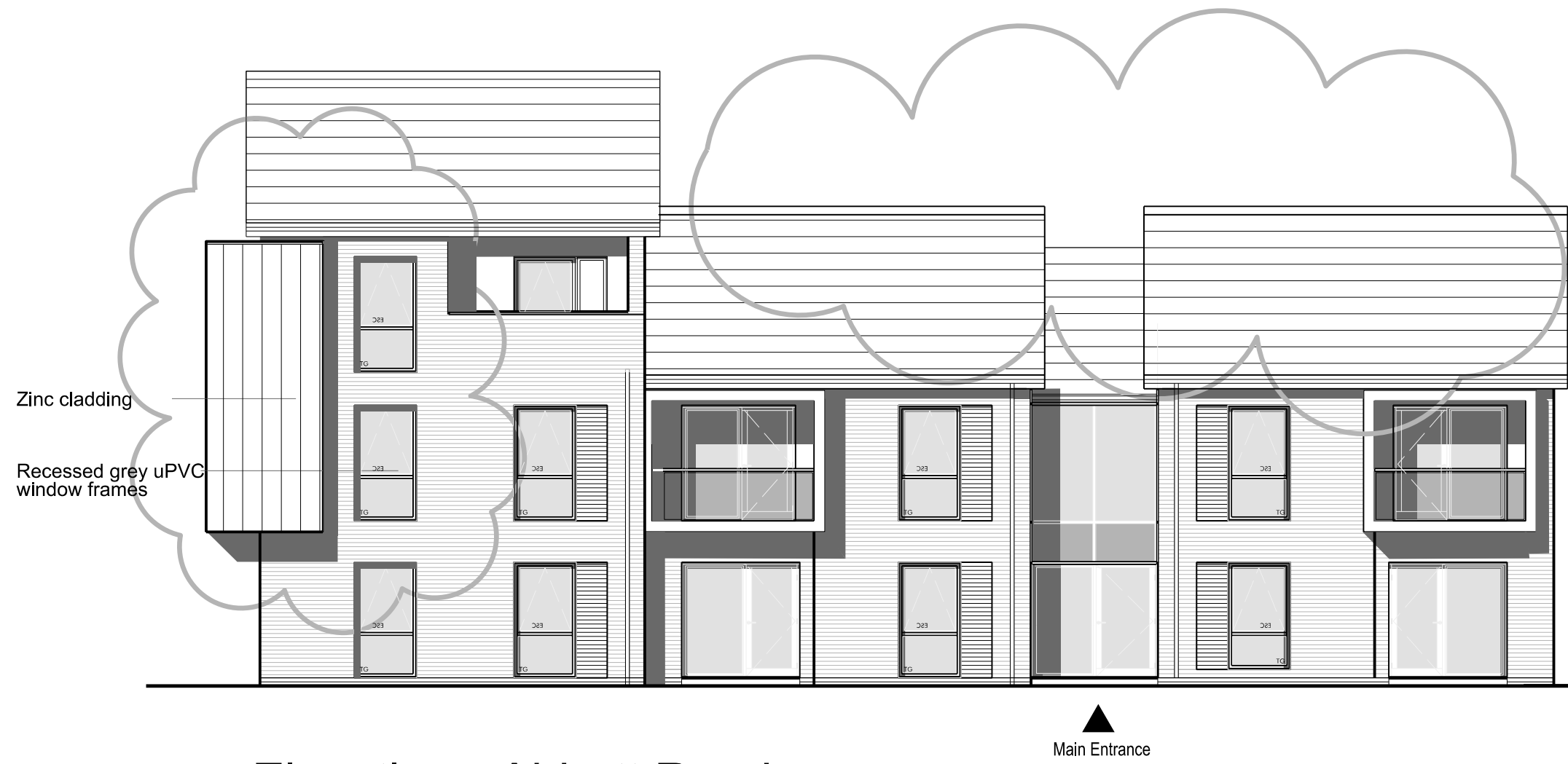
Elevation - Abbott Road