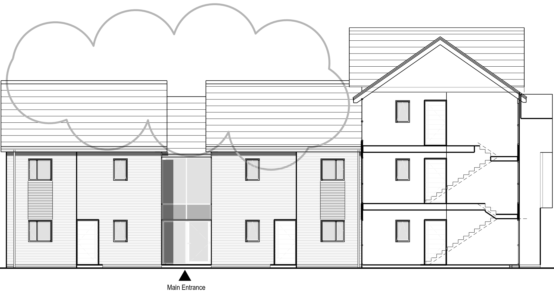
Rear Elevation 2