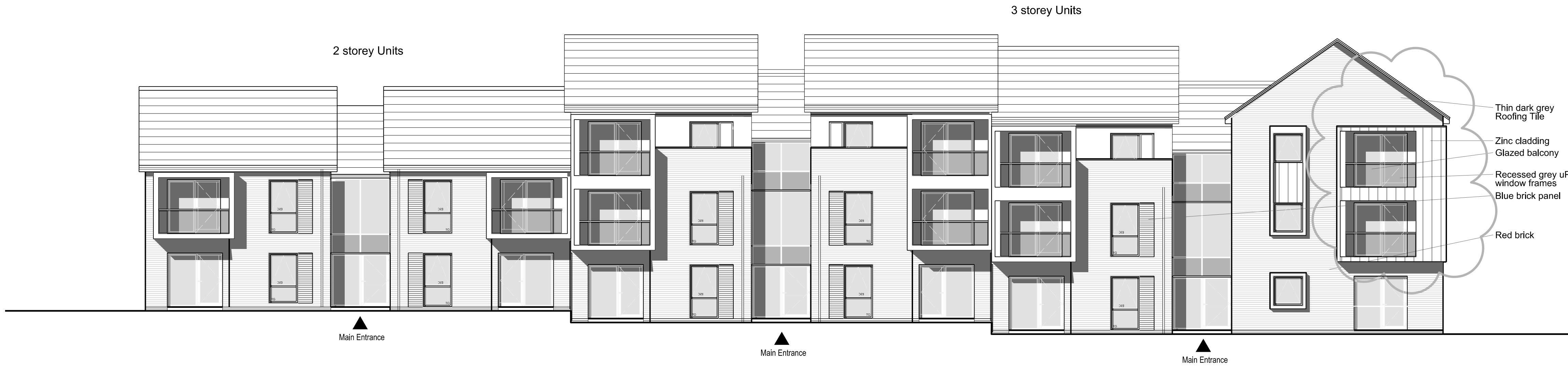
Elevation - Novi Lane