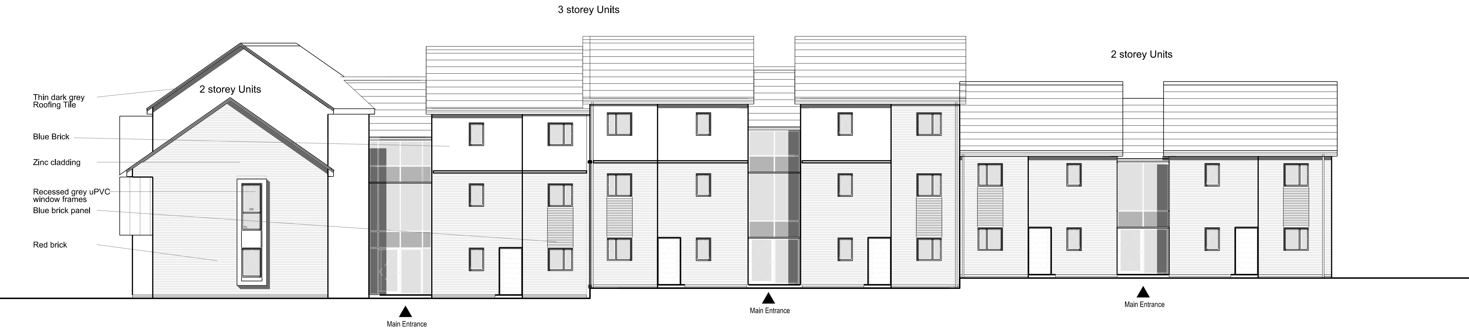
Rear Elevation 1