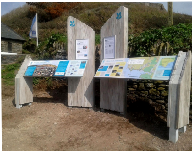
Bespoke information boards by The Grain or similar approved