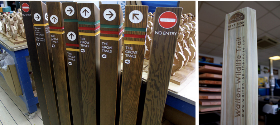
Bespoke posts by The Grain or similar approved