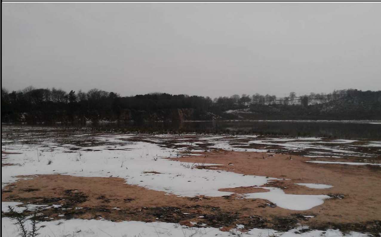
Plate 2 - Q2 North West Face - February 2013