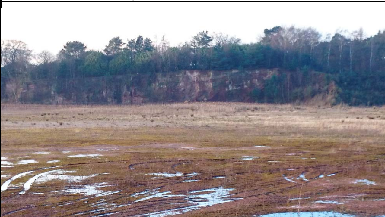
Plate 4 - Q2 North West Face - January 2015