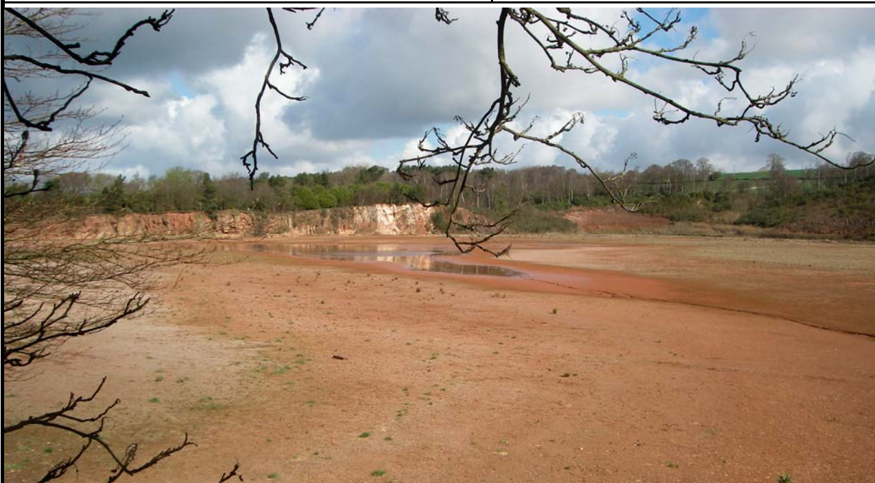
Plate 3 - Q2 North West Face - April 2013