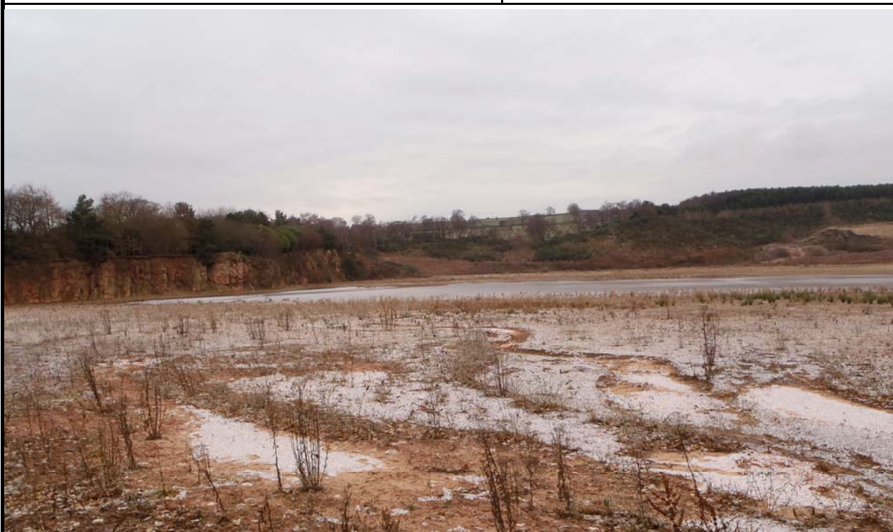
Plate 1 - Q2 North West Face - December 2012