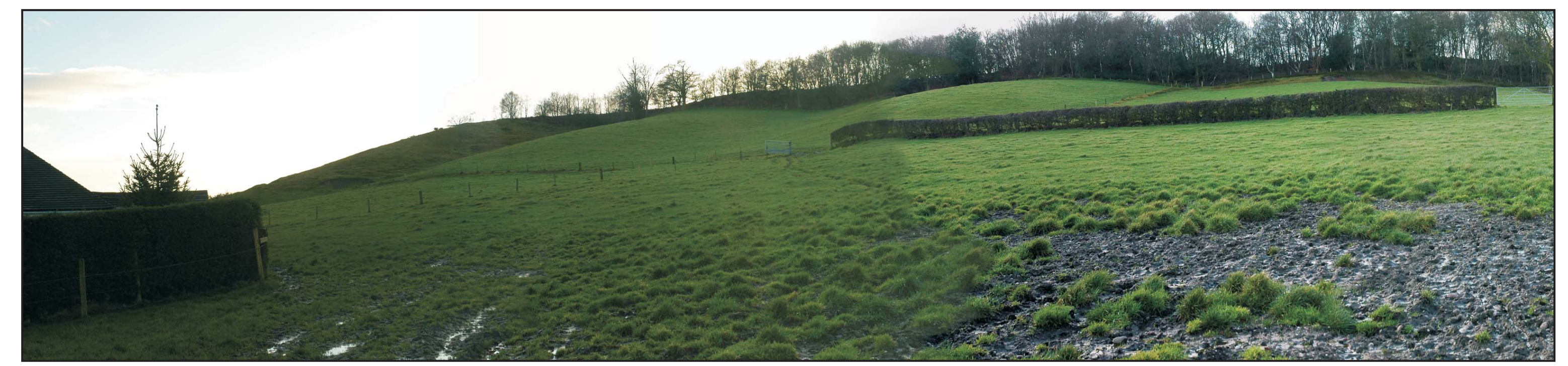
VIEWPOINT 3: VIEW SOUTH-WEST, E400310, N341239, Elevation 157.9m (including 1.7m eye level) approximately 180m from site