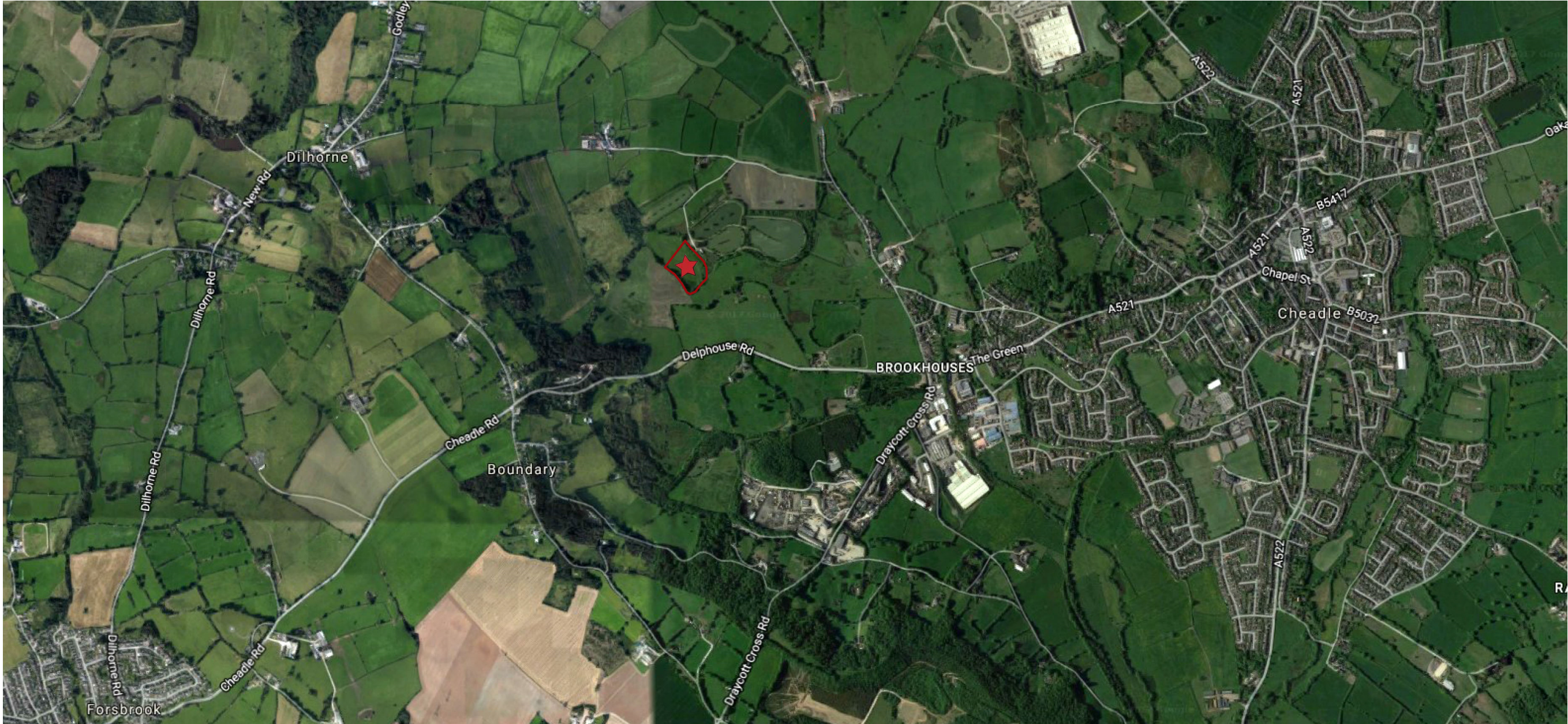
aerial photography nts