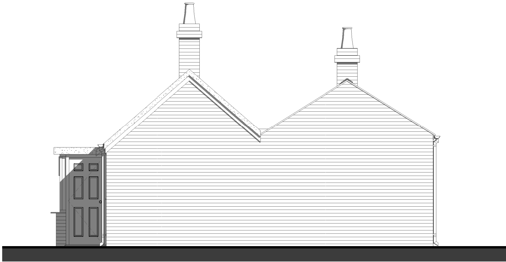
west elevations 'as existing'