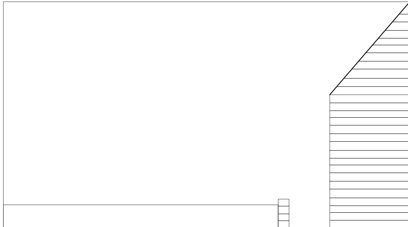
Existing elevation Scale = 1:50

Zachary Hall 16 Friars Close Cheadle ST10 1AT 07720990480 zachal00@gmail.com