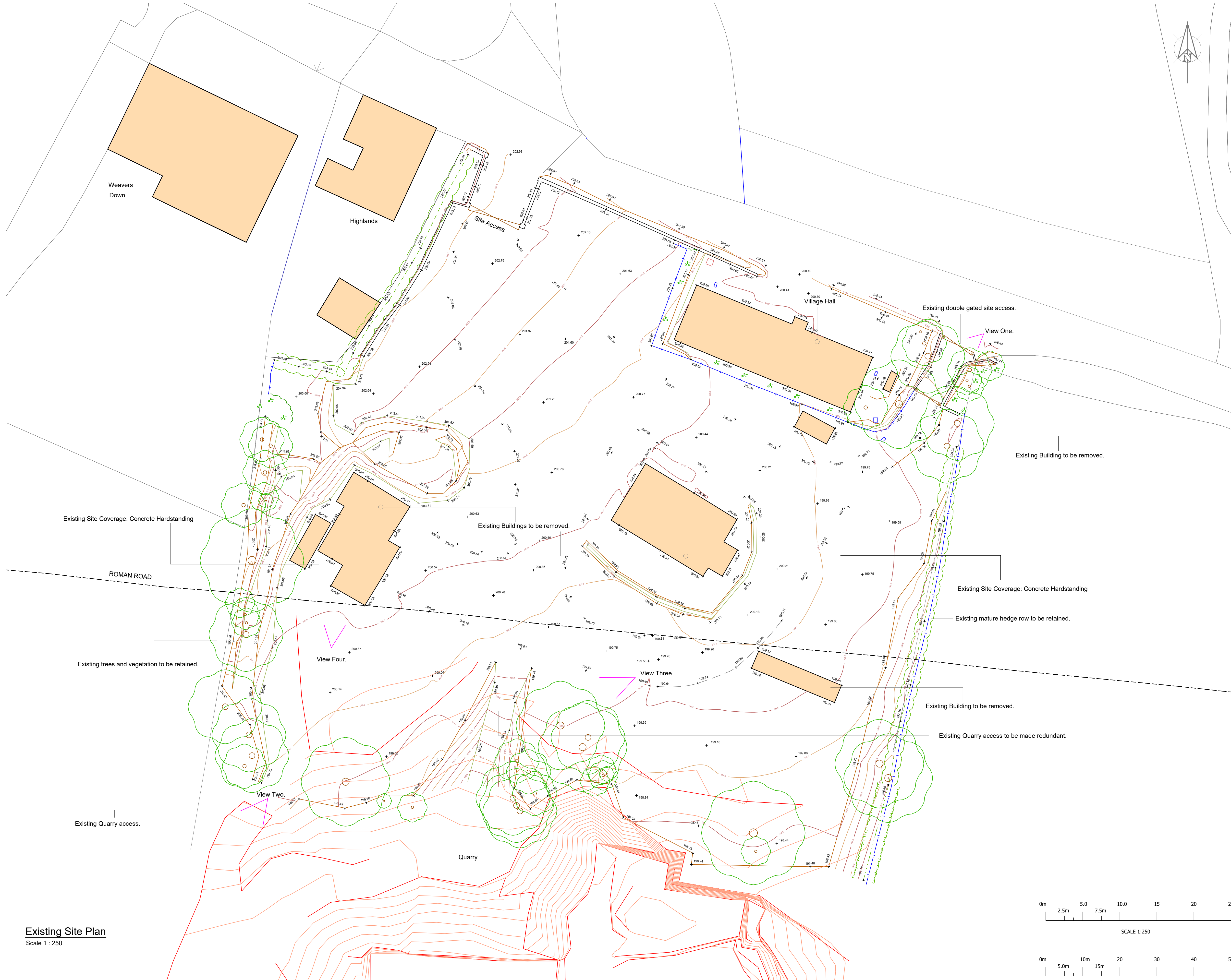
Existing Site Plan Scale 1 : 250