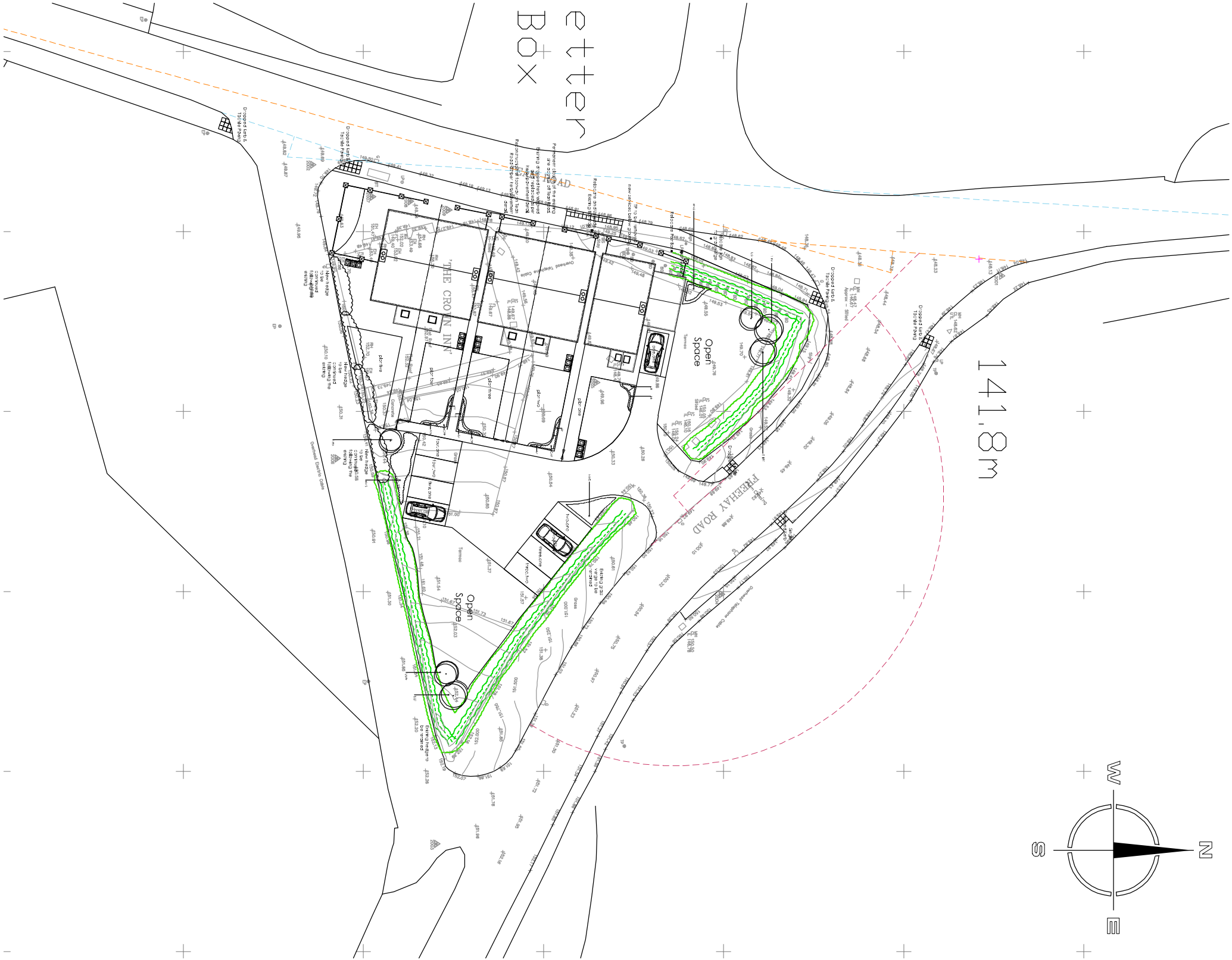
SITE BLOCK PLAN 1:500