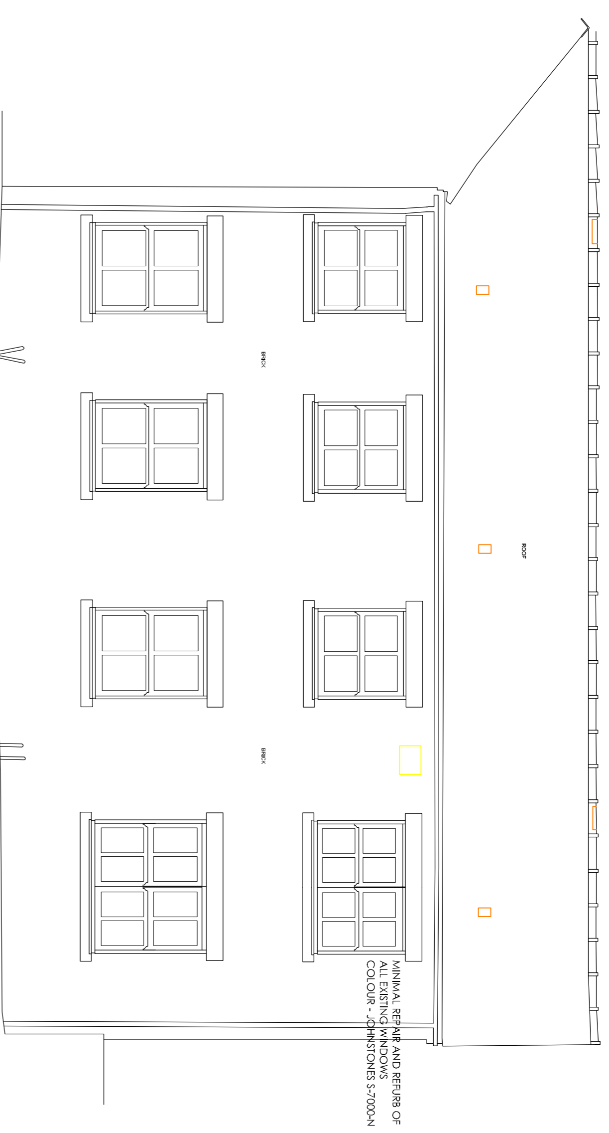
Datum 184.00m ELEVATION 4