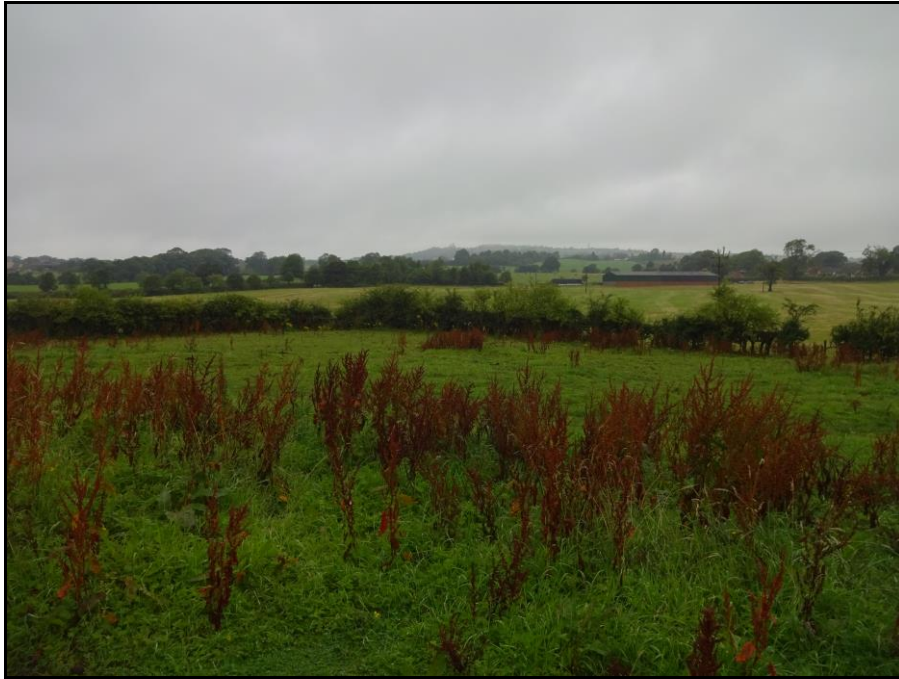
Photograph 12 showing the grassland on site