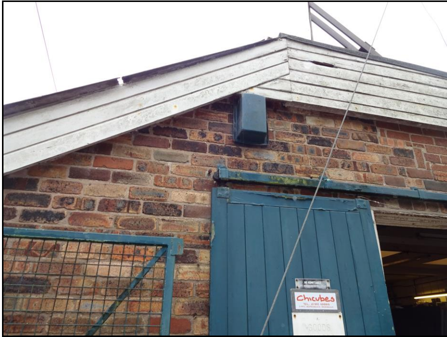
Photograph 2 showing wooden cladding and minor damage