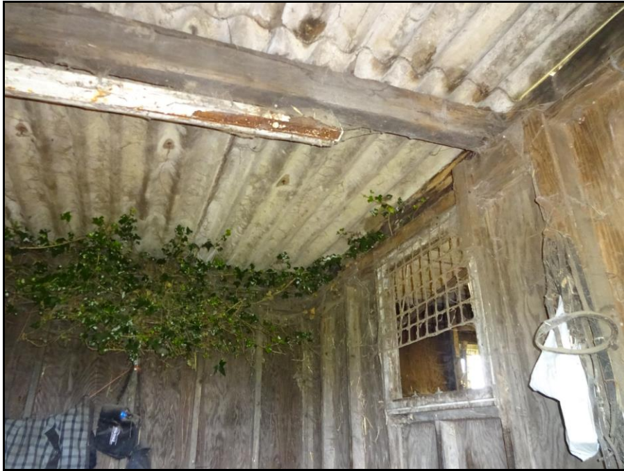
Photograph 11 showing the internal space of the stable