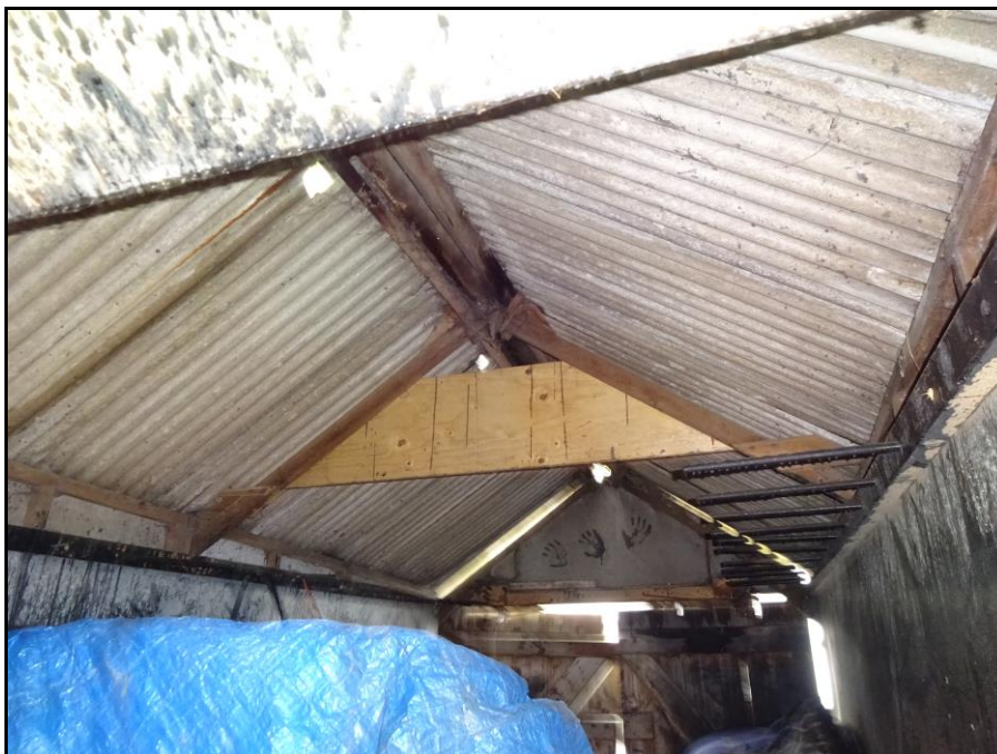
Photograph 9 showing the internal space of one shed