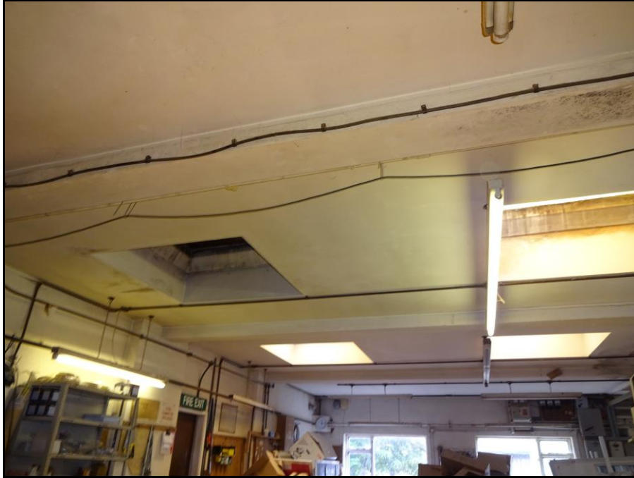
Photograph 4 showing the main work space