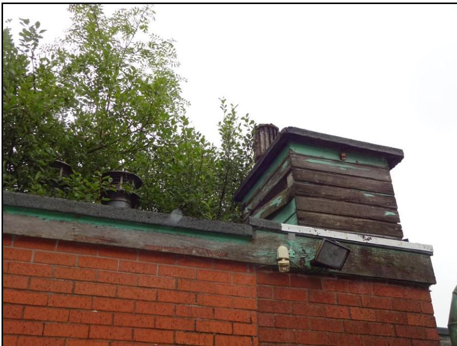
Photograph 3 showing the bargeboard and chimney