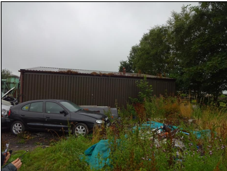
Photograph 6 showing the car repair workshop