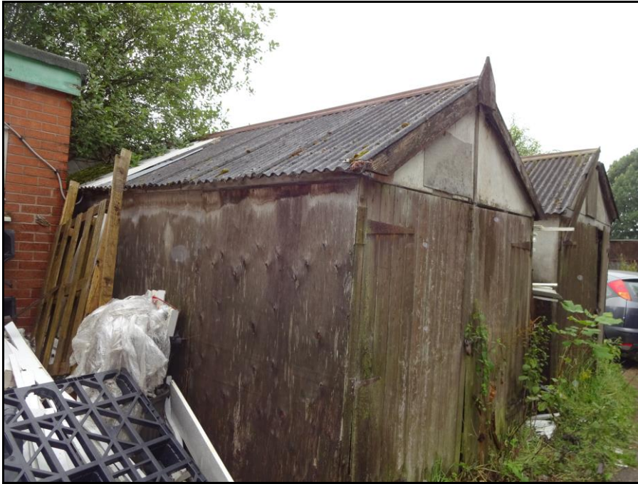
Photograph 8 showing two of the sheds on site