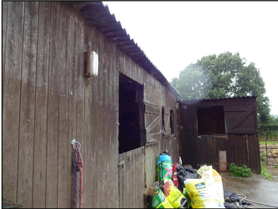
Photograph 10 showing the stable