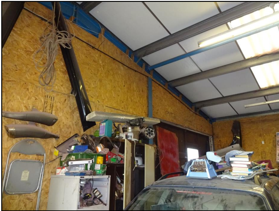
Photograph 7 showing the internal space of the car garage