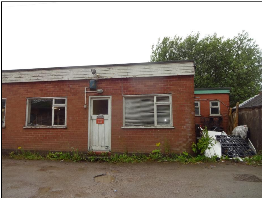
Photograph 1 showing the brick built workshop