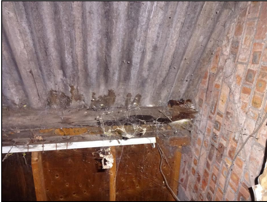
Photograph 5 showing the internal roof and cobwebs