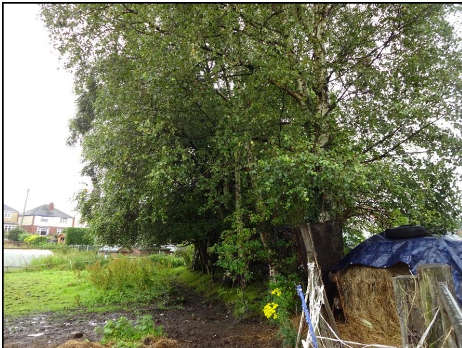
Photograph 13 showing some of the trees on site