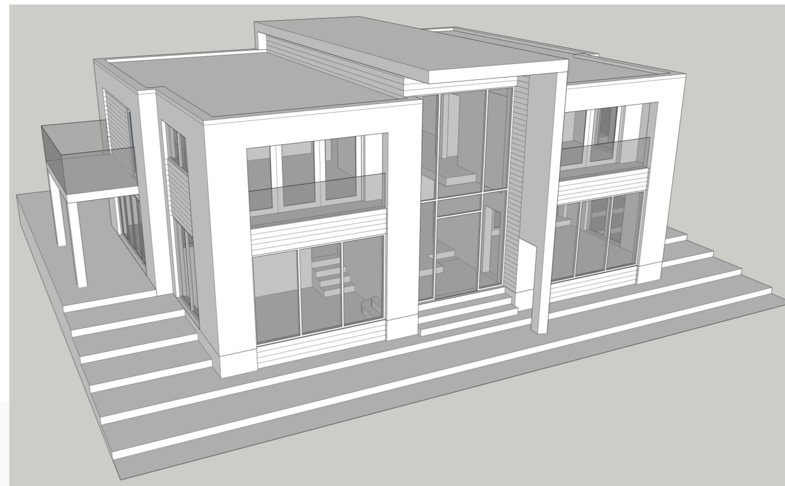
PROPOSED WEST ELEVATION 3D VIEW