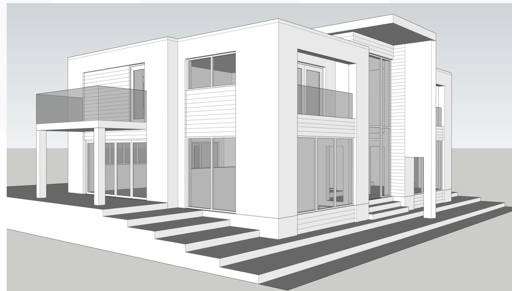
PROPOSED SOUTH ELEVATION 3D VIEW