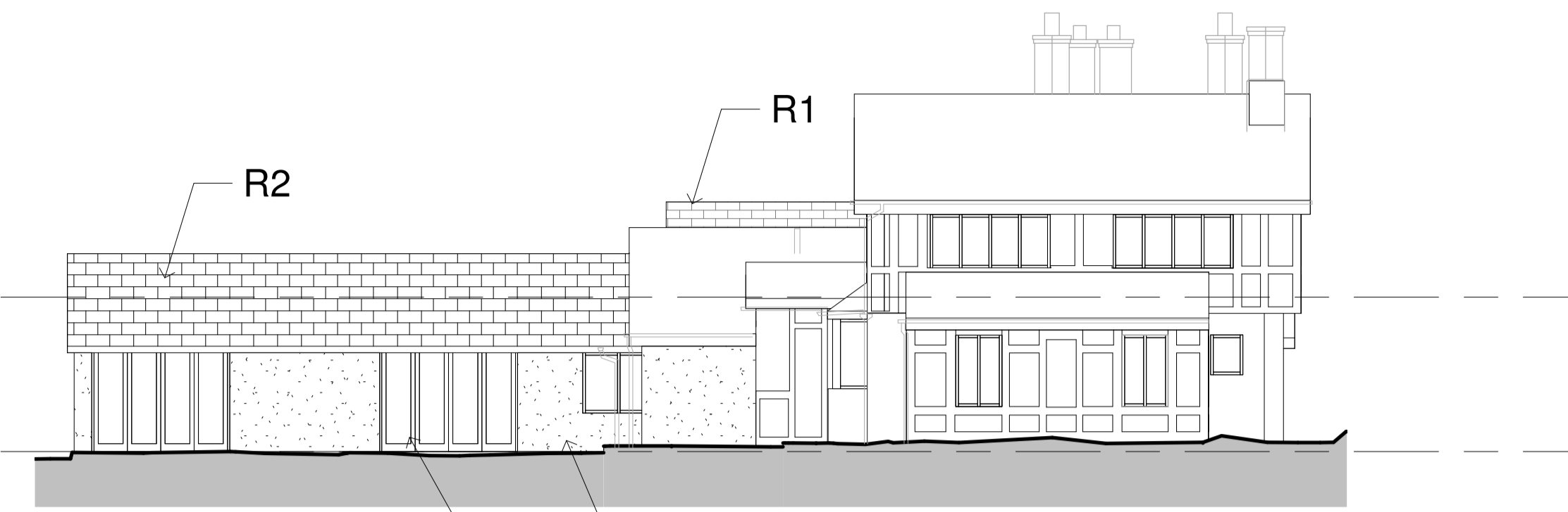
Elevation 2 As Proposed SCALE 1 : 100