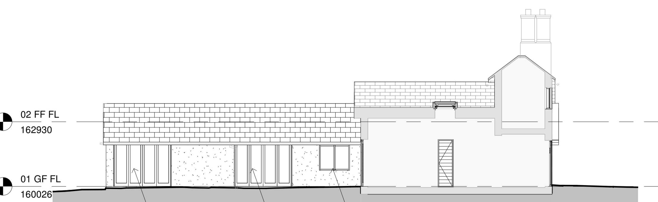
Elevation/Section 5 As Proposed SCALE 1 : 100