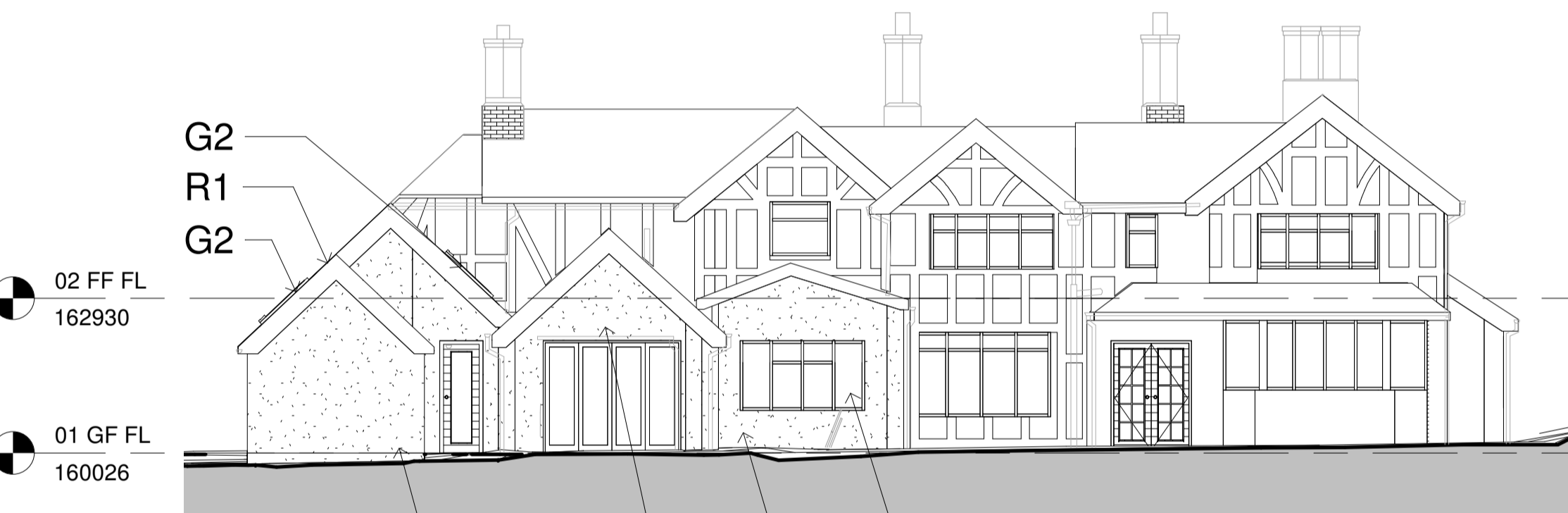
Elevation 3 As Proposed SCALE 1 : 100