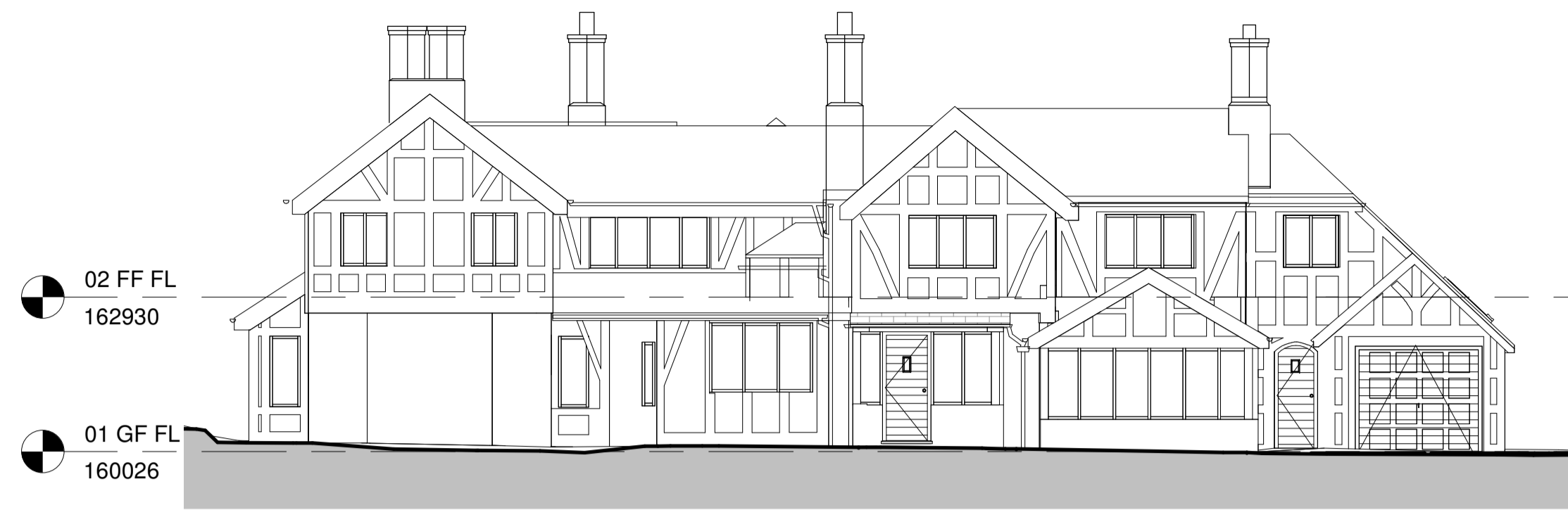
Elevation 1 As Proposed SCALE 1 : 100