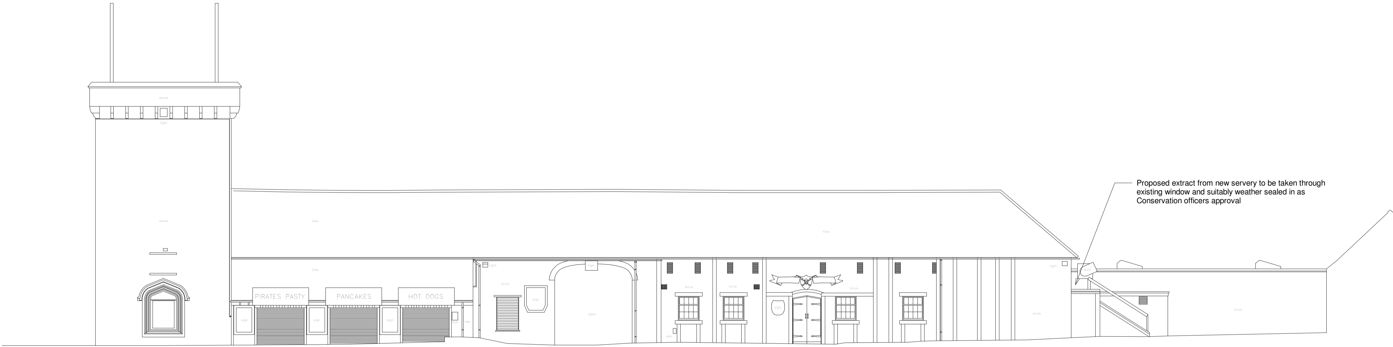
Proposed Outer Area Elevations 1 : 100