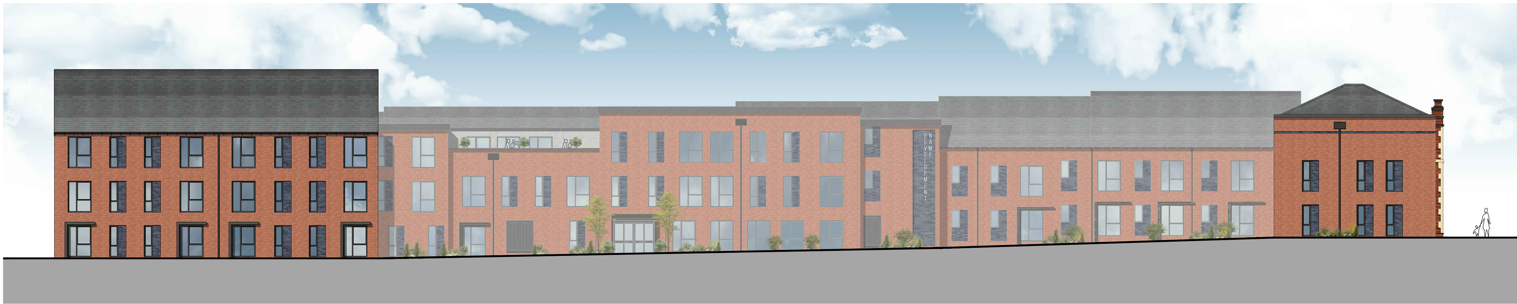
Portland Street Elevation Scale 1:150