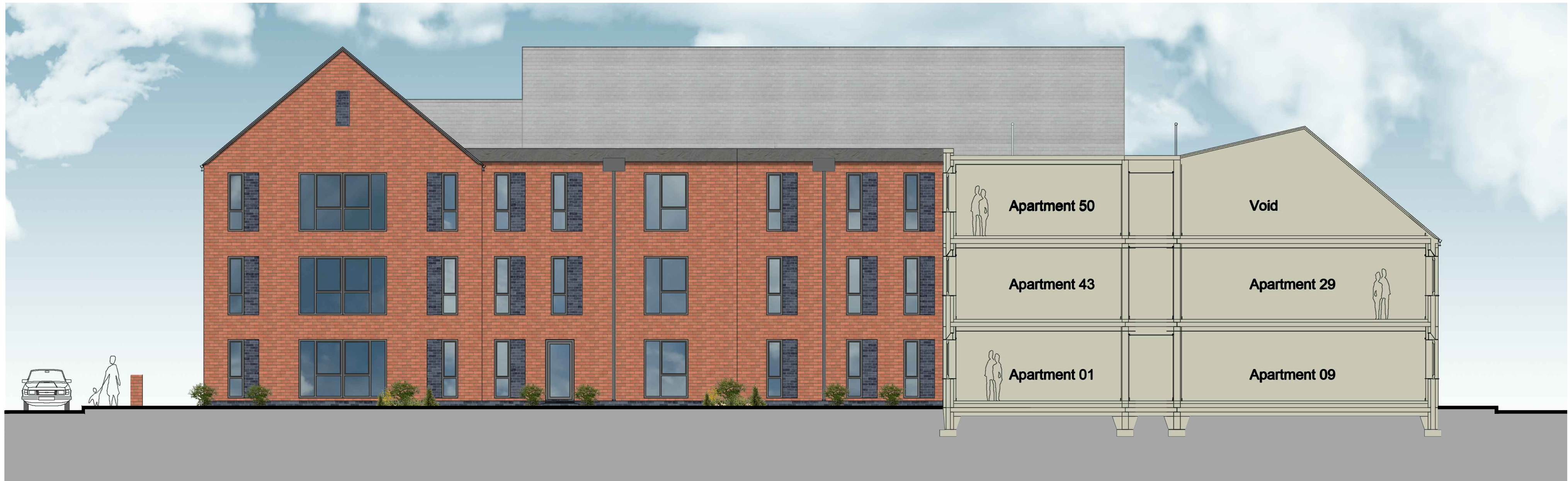
Interior Courtyard Elevation A Scale 1:100