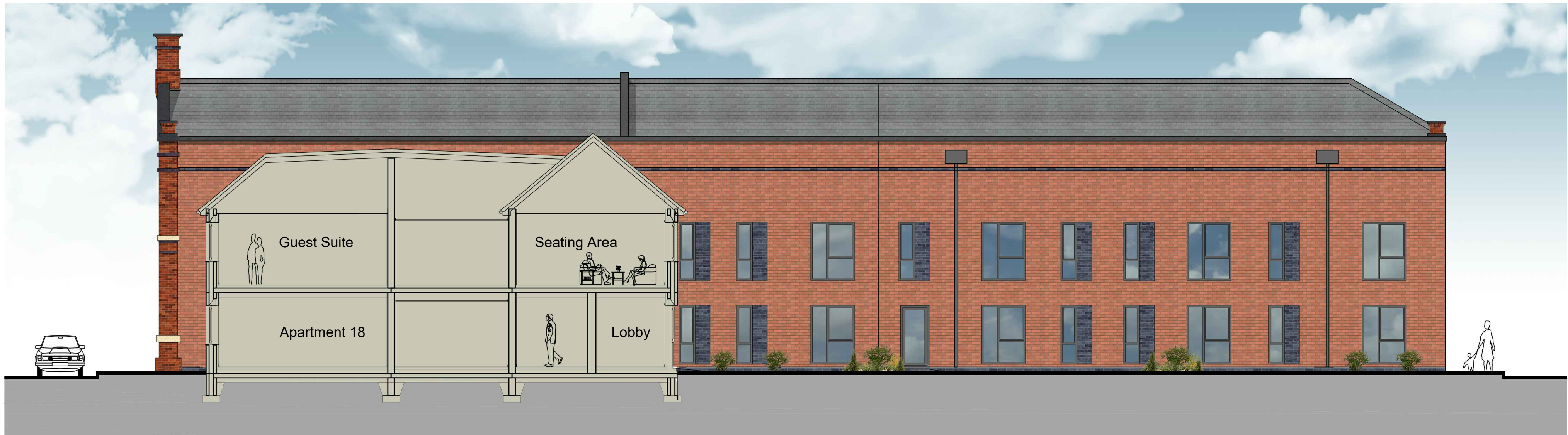
Interior Courtyard Elevation B Scale 1:100