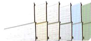
WHITE, CREAM, LIGHT BLUE, LIGHT GREY, SAND, ENVIRO GREEN