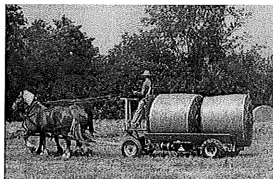
Ill. 1: Round-bale mover

principles of organic farming. The objective of a closed cycle can in many respects be better achieved using horses than with a tractor. In the first place, the fuel, that is the feed for the horse, is produced on the farm itself, not bought in from outside. Horses make use of converted solar energy, in the form of grass and grain, without it having to be expensively processed and thereby losing a large part of its energy value.