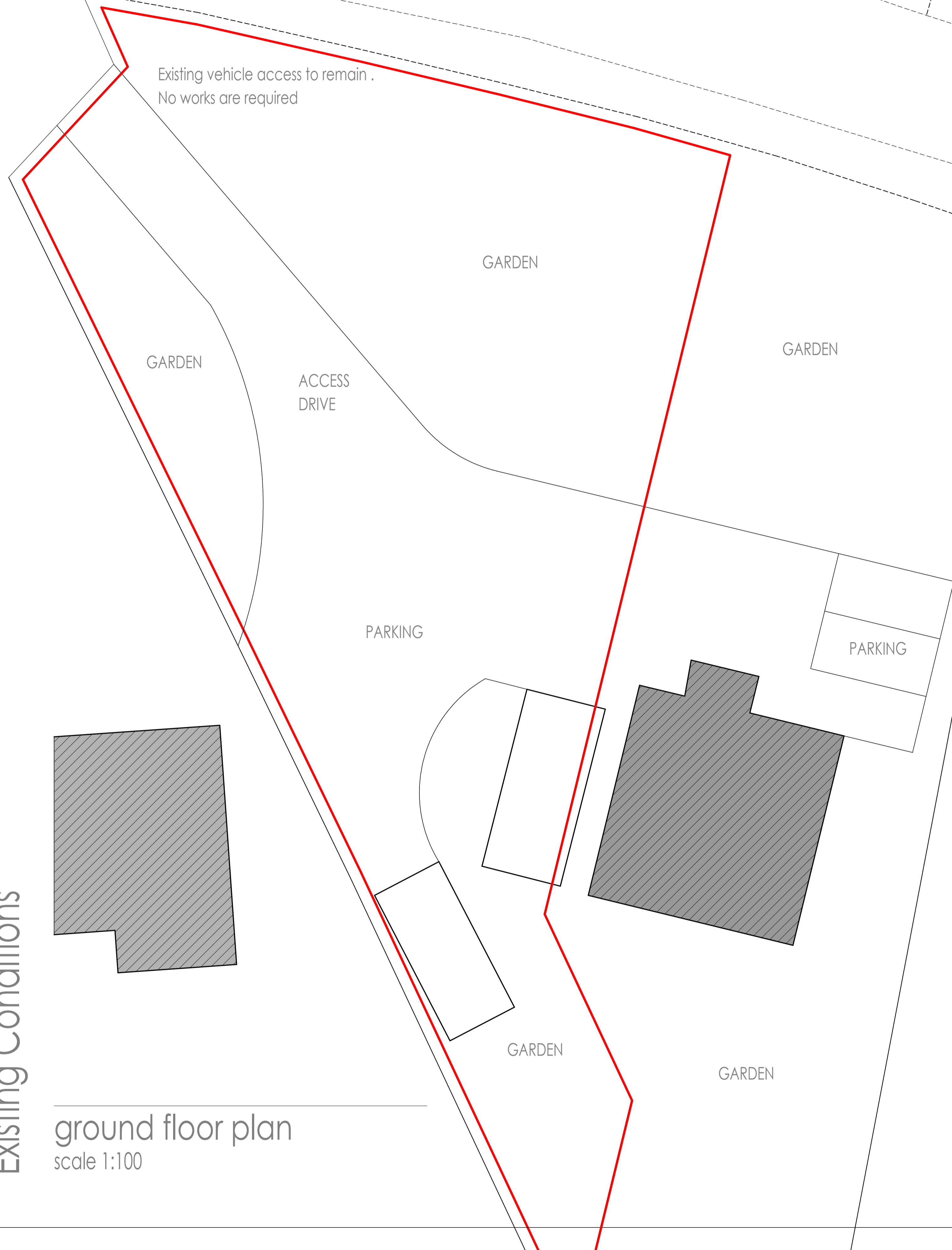
ground floor plan scale 1:100