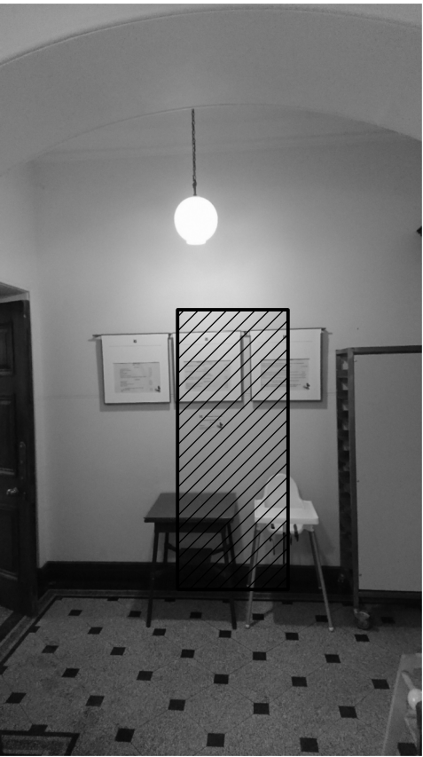
Photo Interpretation of door opening