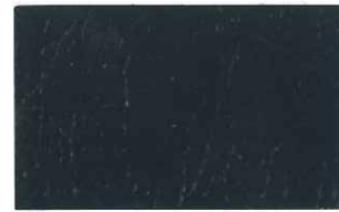
Raven CD1 18B29