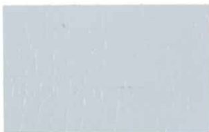
Albatross CD1 18B17