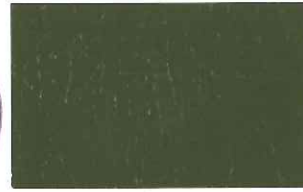
Olive Green CD1 12B27