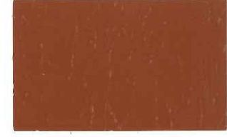
Terracotta CD2 04C39