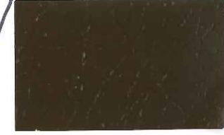
Vandyke Brown CD2 08B29