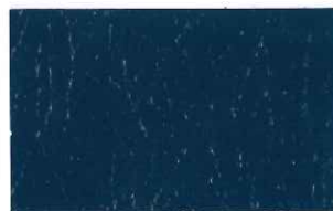
Sargasso CD2 RAL 5003