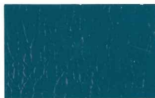
Ocean Blue CD2 18C39