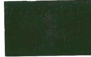
Juniper Green CD2 12B29