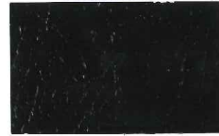
Black CD1 00E53