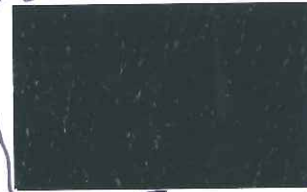
Anthracite CD2 RAL7016