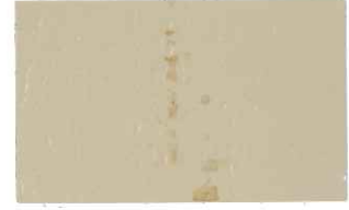
Mushroom CD1 10B19