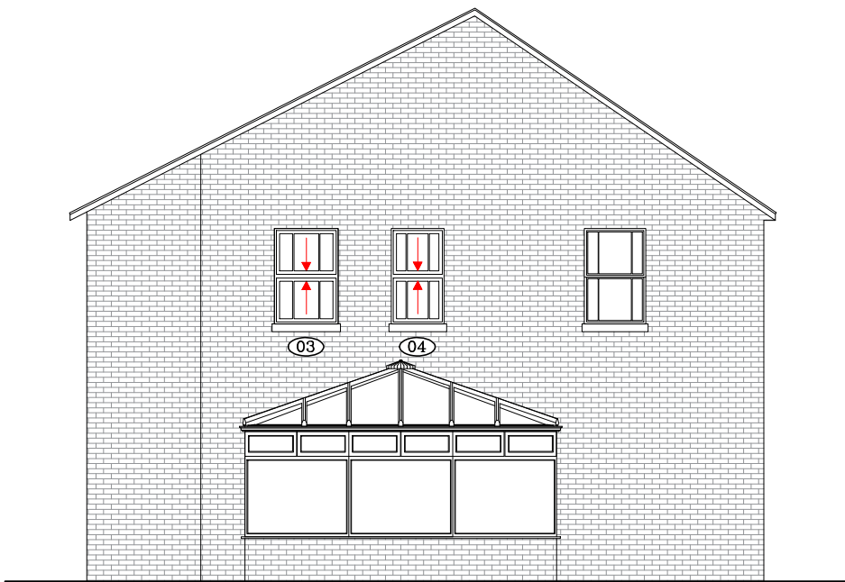
PROPOSED REAR SIDE ELEVATION SCALE 1:100 @A3