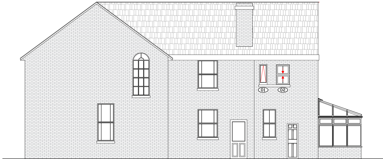
PROPOSED RIGHT SIDE ELEVATION SCALE 1:100 @A3