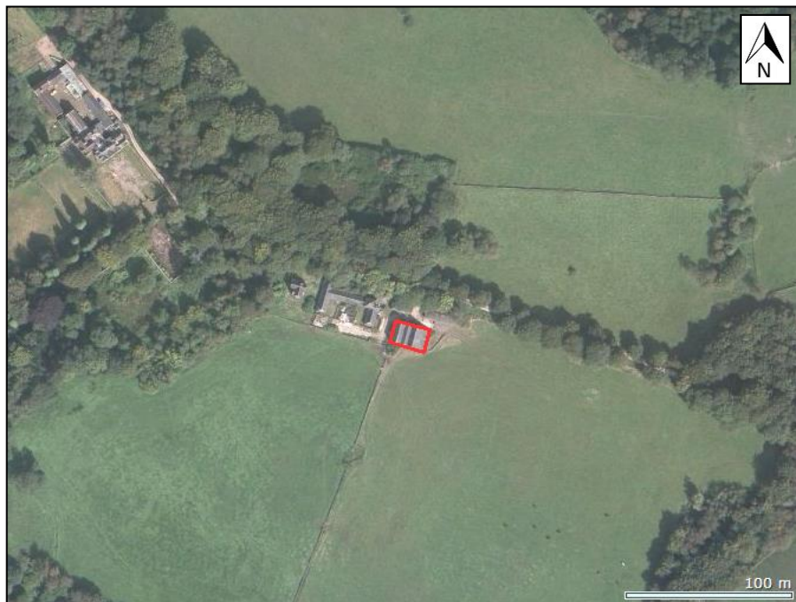
Figure 1: An aerial map showing the location and boundary of the barn to be re-developed at Home Farm, Sharpcliffe (outlined in red) in relation to some of the immediately surrounding habitats.

The building of interest is set in a rural location within Sharpcliffe, Ipstones and it occupies an area of approximately 305m 2 . The barn is bordered to the east, south and south-west by improved/agricultural grassland with further agricultural grassland, hedgerows/tree lines and woodland to the north. The closest settlement to the site is Ipstones, which is located roughly 2.2km to the south-east. There are a number of ecological features that would benefit both bats and birds both on and around the site (within a 2km radius) including; woodland, scattered farms, mature trees, water courses (including streams/brooks) and linear features (such as hedgerows and stone walls). The site and surrounding habitat is considered to provide all of the necessary features which both bats and birds require to thrive (for roosting/nesting and foraging purposes).