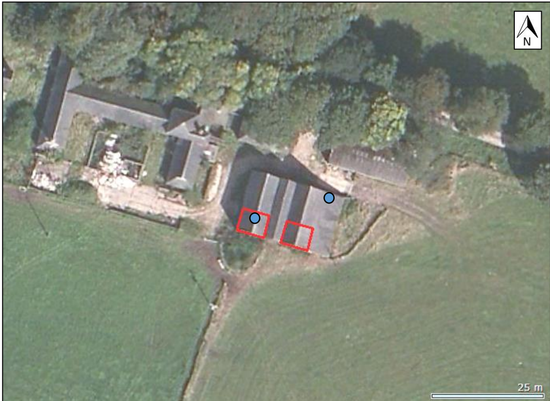
Figure 3: An aerial image showing the barn surveyed. The areas outlined in red indicate the two-storey sections and the blue circles indicate the approximate locations of the [active and inactive] swallow nests.