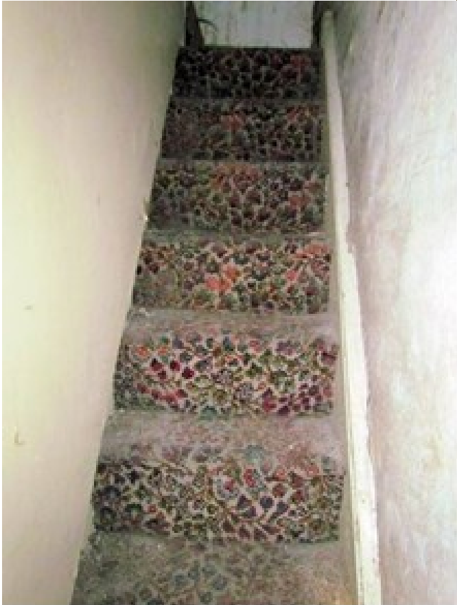
Staircase Joining Rooms 17 and 21