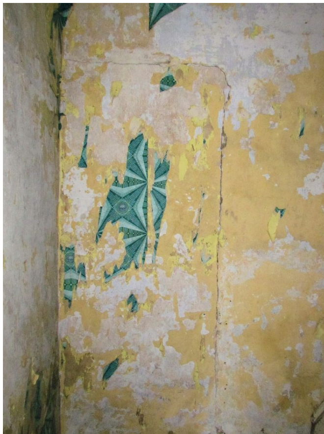
Infilled Doorway in Room 14