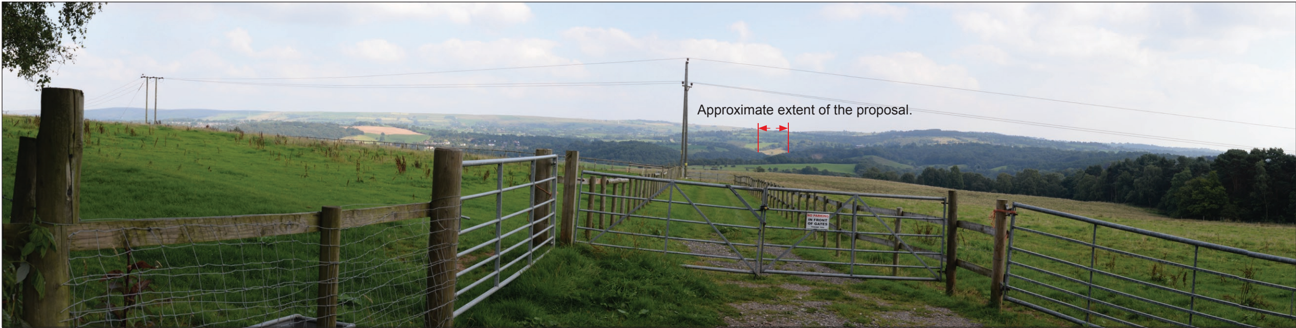
Panorama with markers to indicate extent of the proposal.