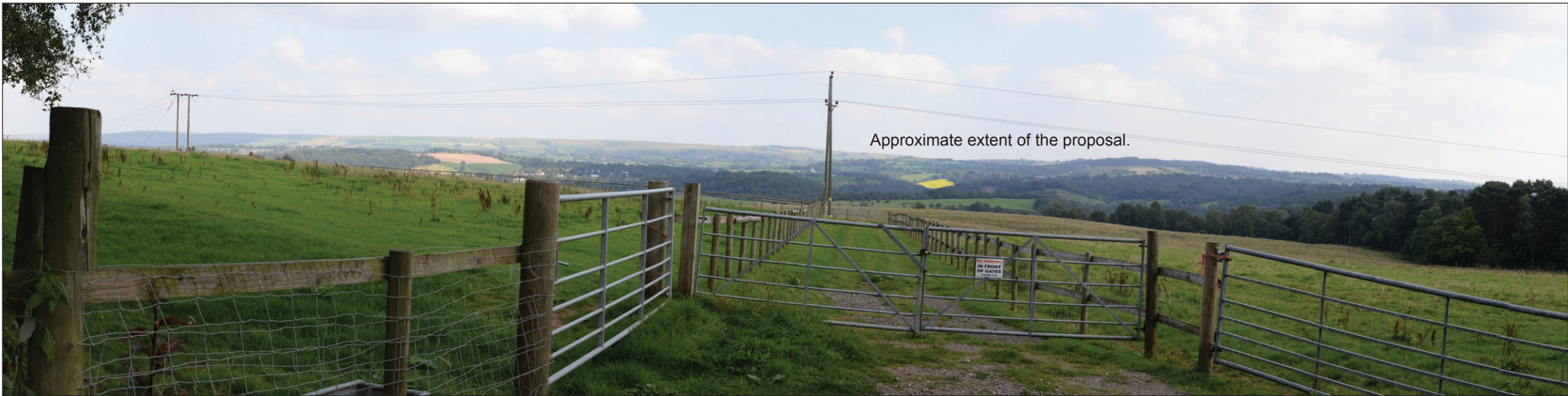
Panorama with colour block to indicate extent of the proposal.