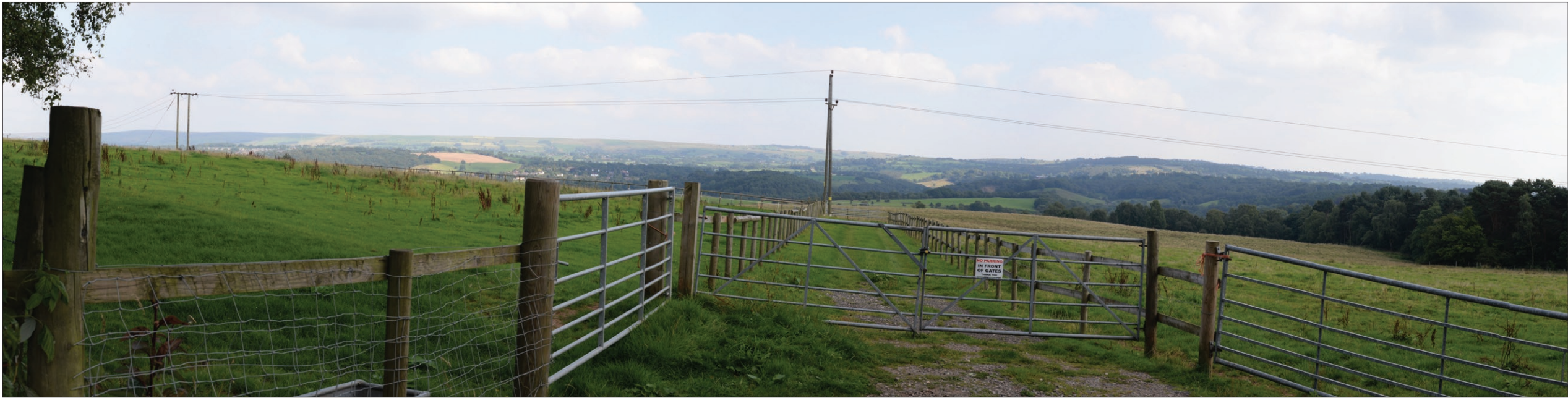
Panorama - c. 100° field of view.