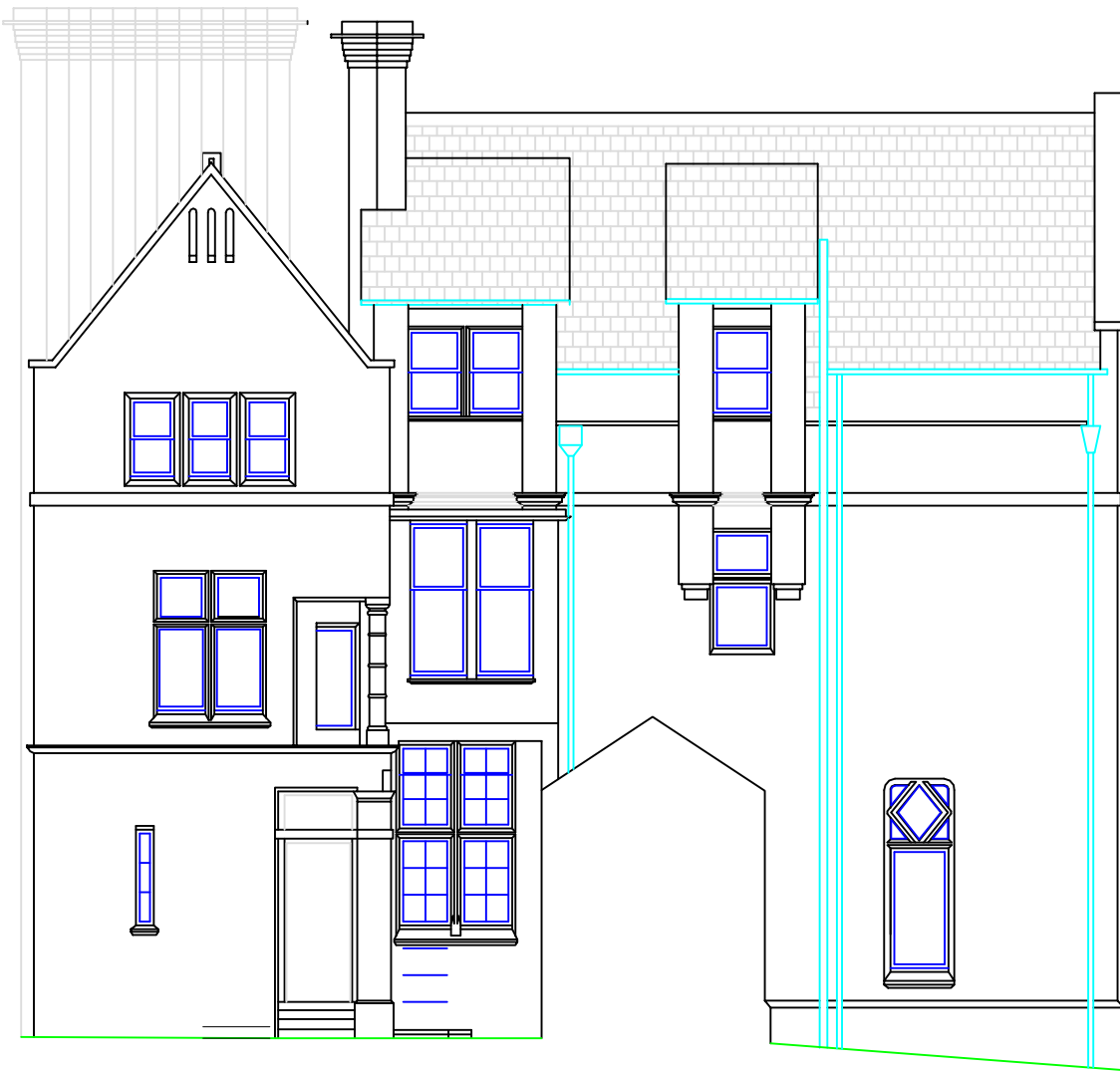
Elevation D Datum 196.00 A.O.D.