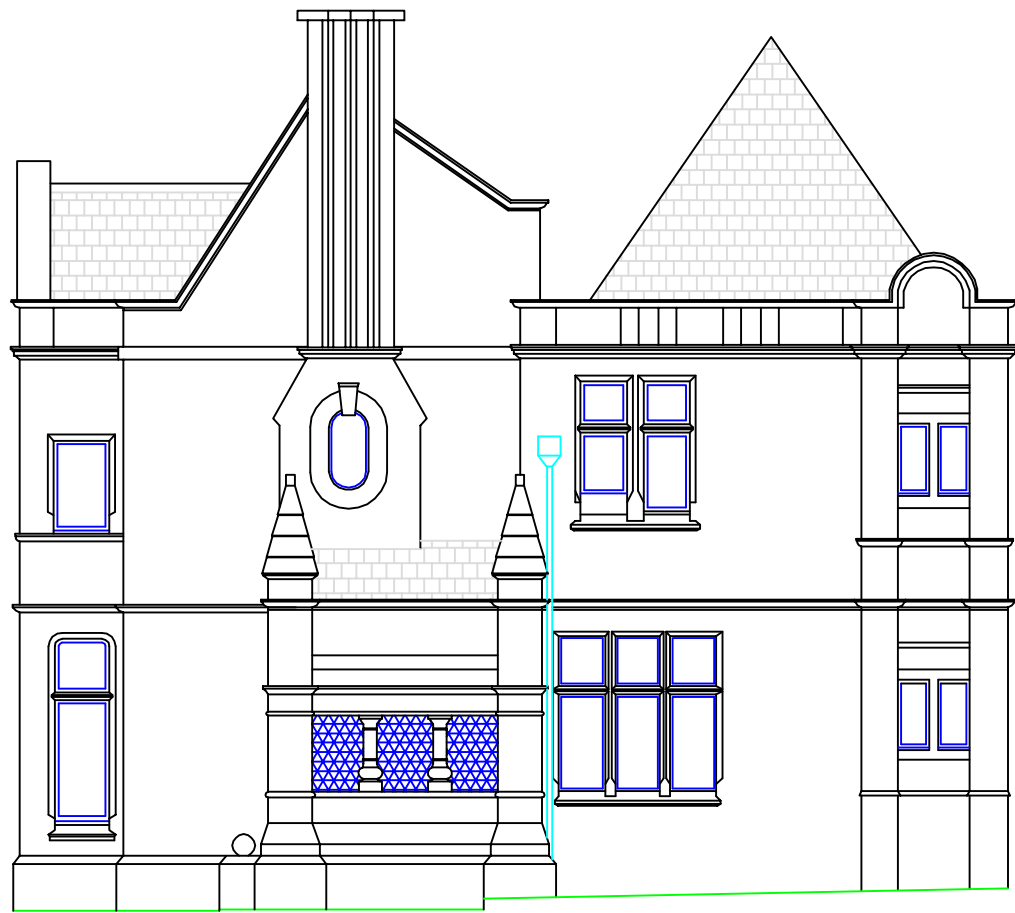
Elevation C Datum 196.00 A.O.D.