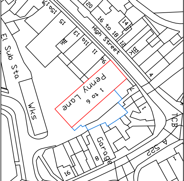
Location Plan (1:1250)

This drawing is protected by copyright and the information contained herein is the property of William McColl. The drawing must not be copied and the information contained therein may not be used or disclosed without written permission of and in the manner permitted by William McColl.