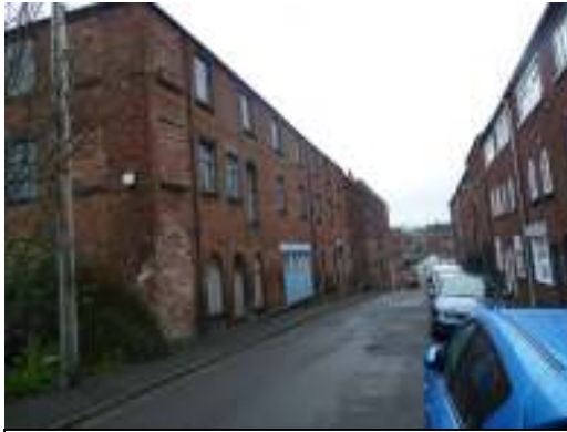
Plate 1: View of London Street Mill along London Street, Leek