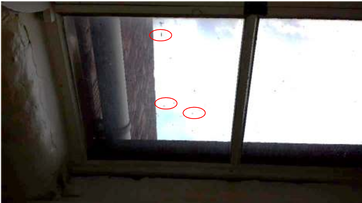
Plate 3: Views of western elevation where some bat evidence was located on window (5d).