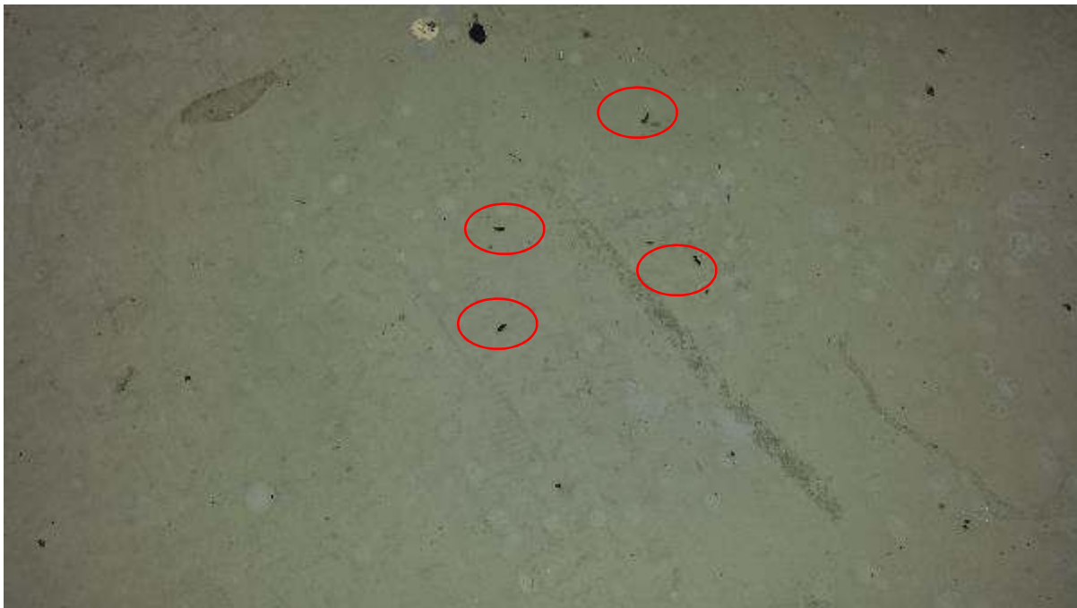
Plate 4 & 5: Views of corridor where bat evidence was located (5d).