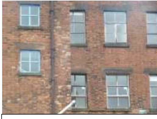
Plate 2: Views of western elevation where bat evidence was located (5d).